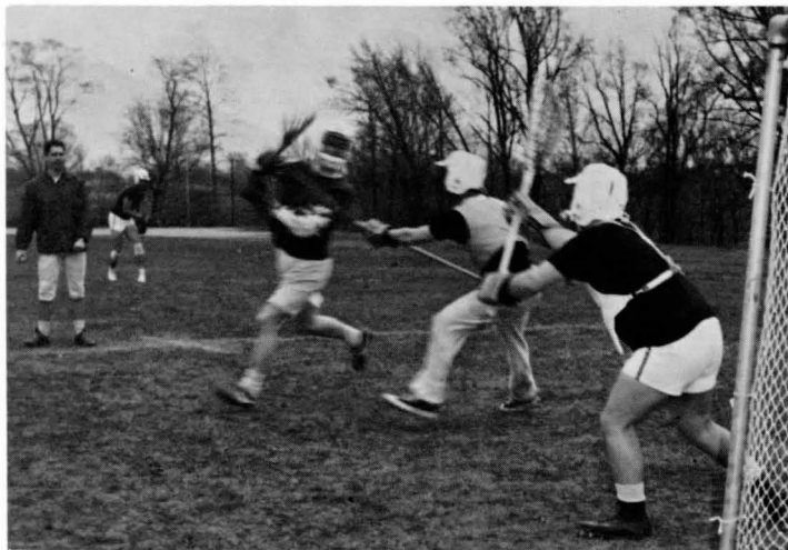
Team goes through drills at Chester Park.